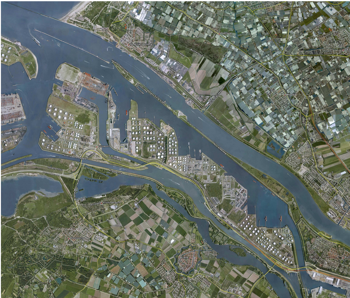
Fig.1 - Example of large industrial area

In The Netherlands large groups of different companies are clustered on special industrial areas, designed to accommodate companies with a high noise emission such as (petro)chemical plants, container terminals, concrete and asphalt producing facilities et cetera. In figure 1 a bird view of such an industrial area is shown. Controlling the noise emission of such industrial areas and with that controlling the noise levels at nearby residential areas (noise immission) is done using specialized (large) computer models. These computer models consist of many plots with a specified reserved sound power (noise emission) for each plot.