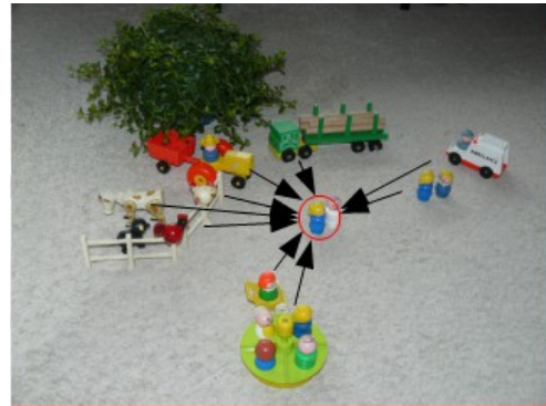
Fig. 4: Contributions of sources-reductionist approach.