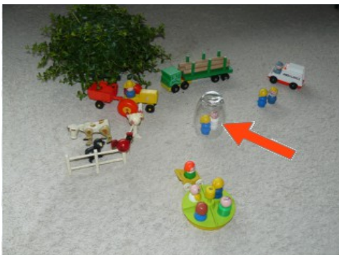
Fig. 3: Complex soundscape-holistic approach.

The difference in approaches is visualised in Figures 3 and 4. The “holistic” approach, starting from the complex soundscape requires analysis a posteriori of the sources and their contributions. The reductionist approach starts from the a priori knowledge of the sources, their strength and character.